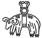
Modiano Australia P/L

Sash & money awarded from the above section entries for the following: